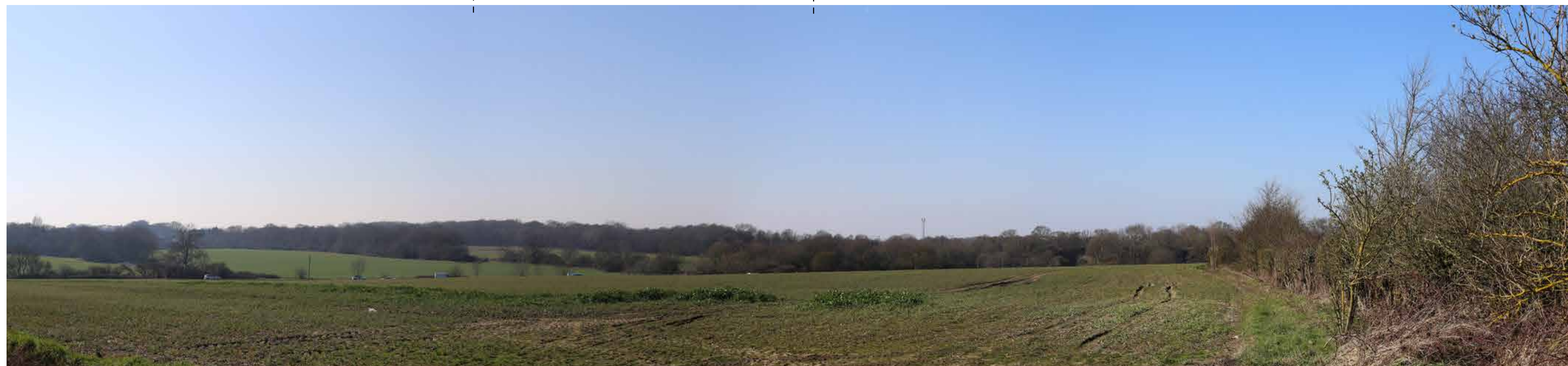
Site Context Photograph 13: View Southwest from Arnolds Farm Lane

This panorama is not to scale. For contextual information only