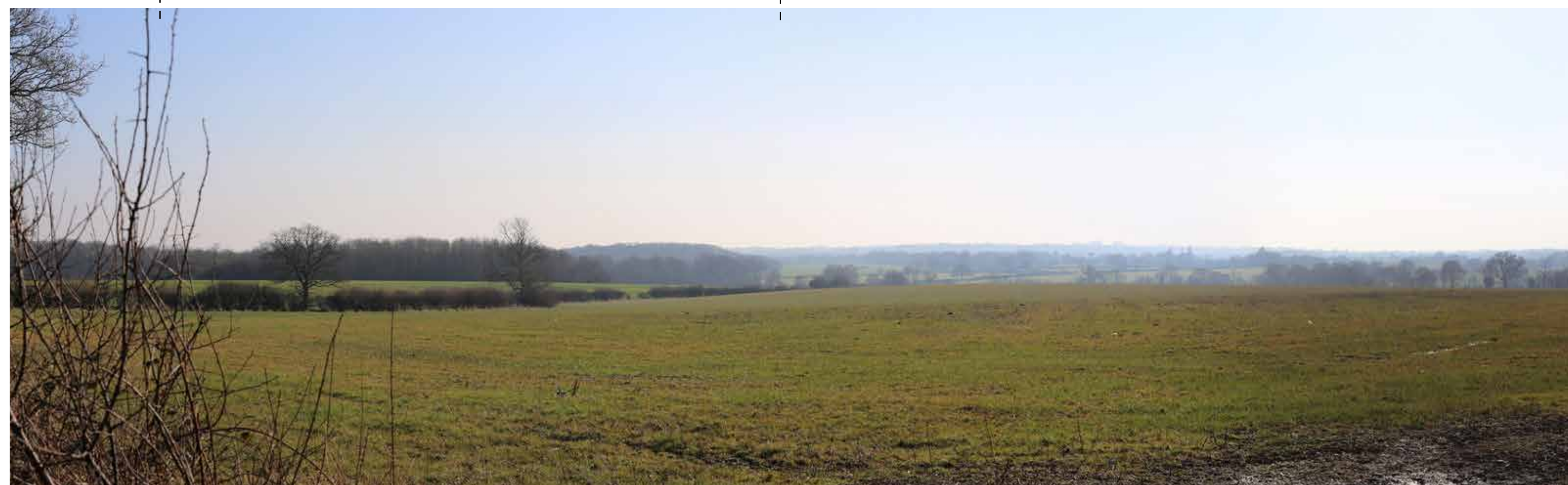
Site Context Photograph 17: View looking South from Thoby Lane

This panorama is not to scale. For contextual information only