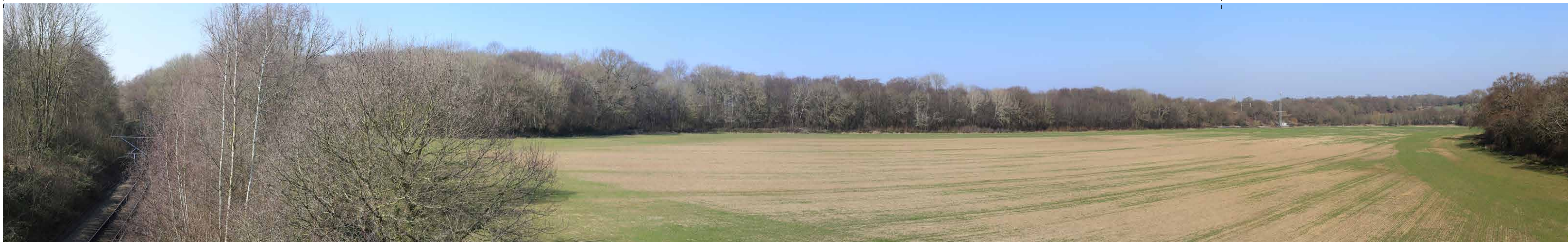
Site Context Photograph 12: View looking Northwest from the Elevated Footbridge of PROW F9 89 272 as it crosses the Railway Line

This panorama is not to scale. For contextual information only