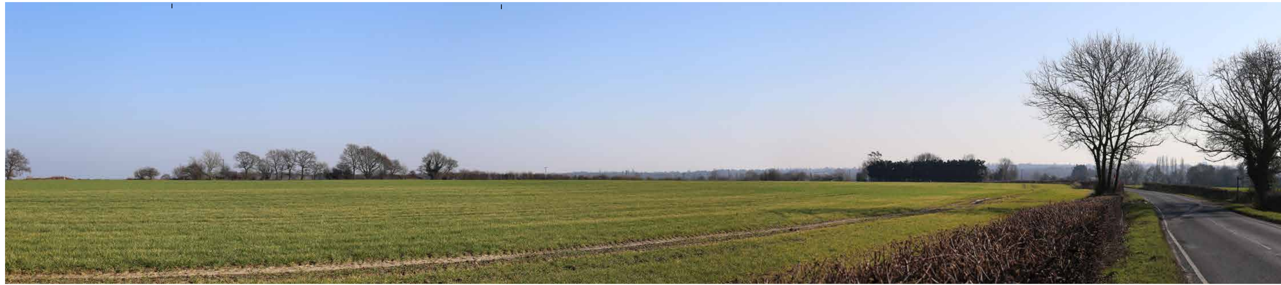
Site Context Photograph 18: View looking Southeast from Doddinghurst Road

This panorama is not to scale. For contextual information only