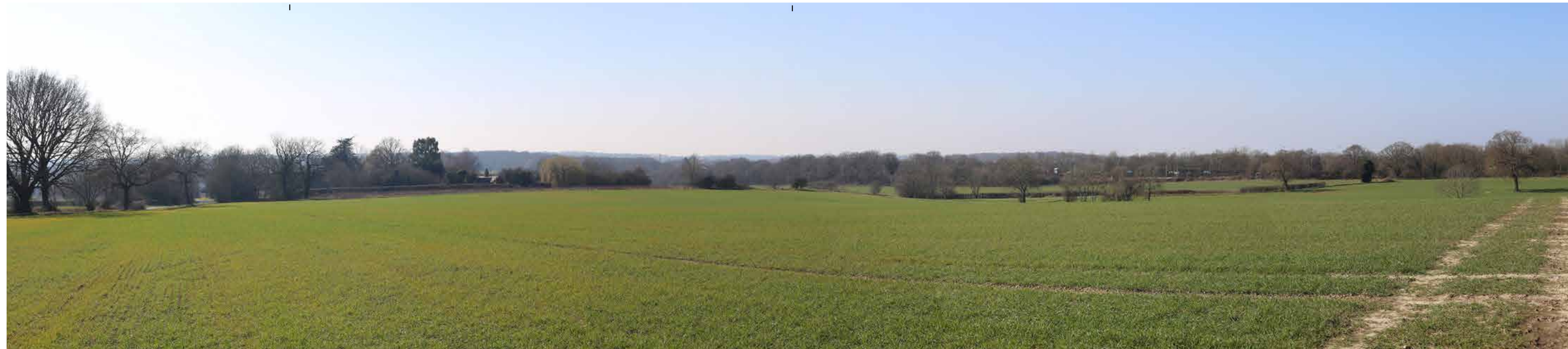
Site Context Photograph 14: View looking Southwest from PROW FP 3 276

This panorama is not to scale. For contextual information only