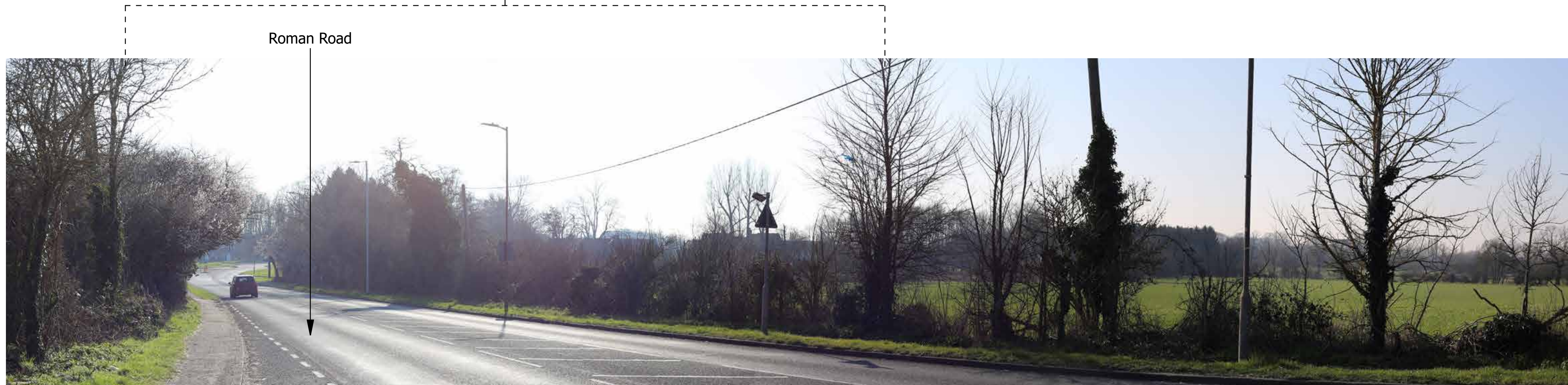
Site Context Photograph 16: View looking Southwest from Roman Road

This panorama is not to scale. For contextual information only