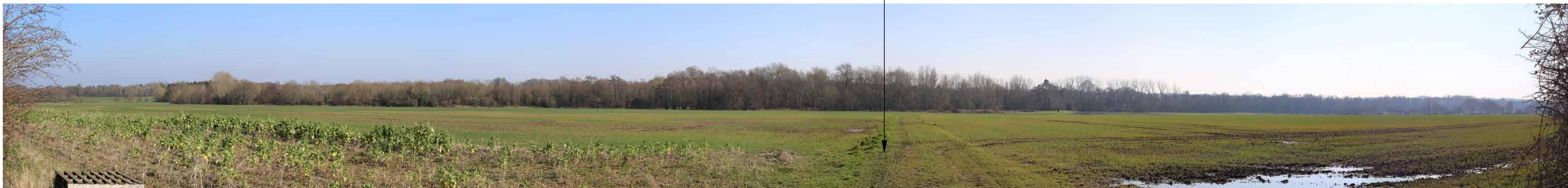
Site Context Photograph 10: View looking Southeast from PROW FP 88 272

This panorama is not to scale. For contextual information only