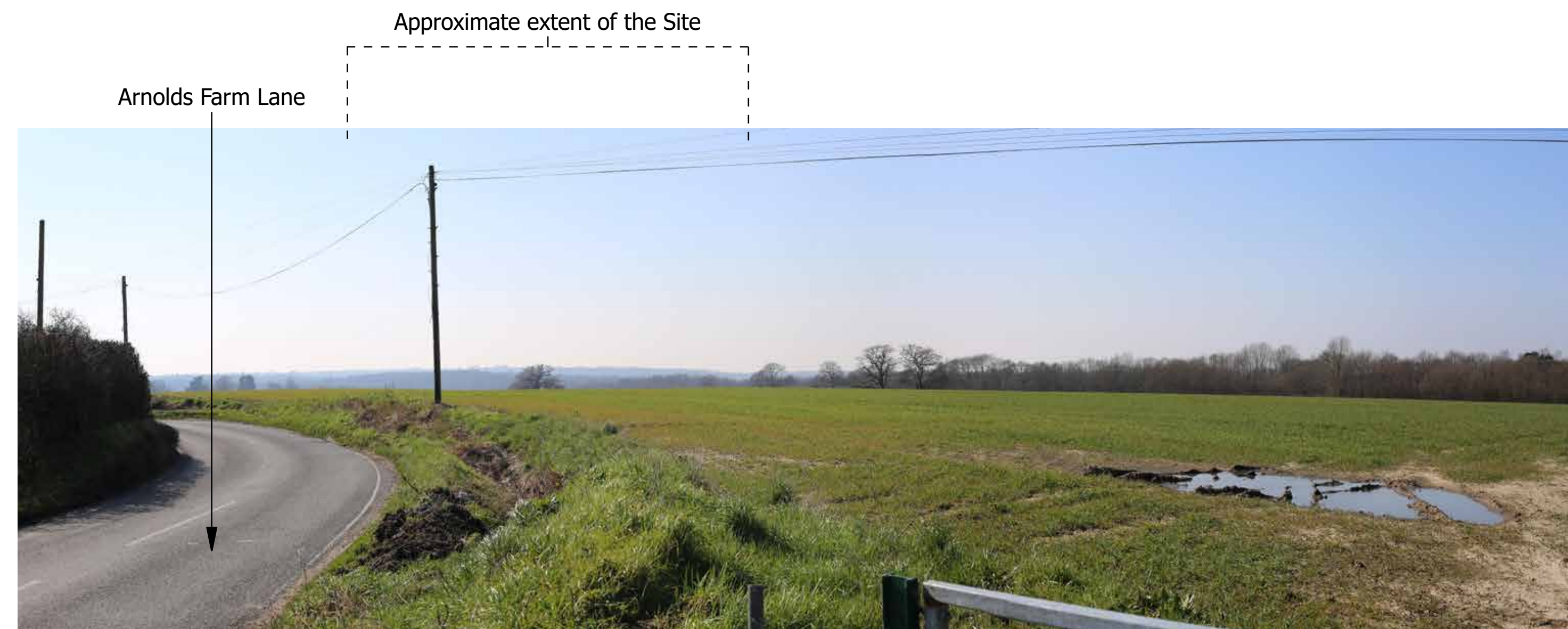
Site Context Photograph 15: View looking Southwest from the Junction of Arnolds Farm Lane and Church Road

This panorama is not to scale. For contextual information only