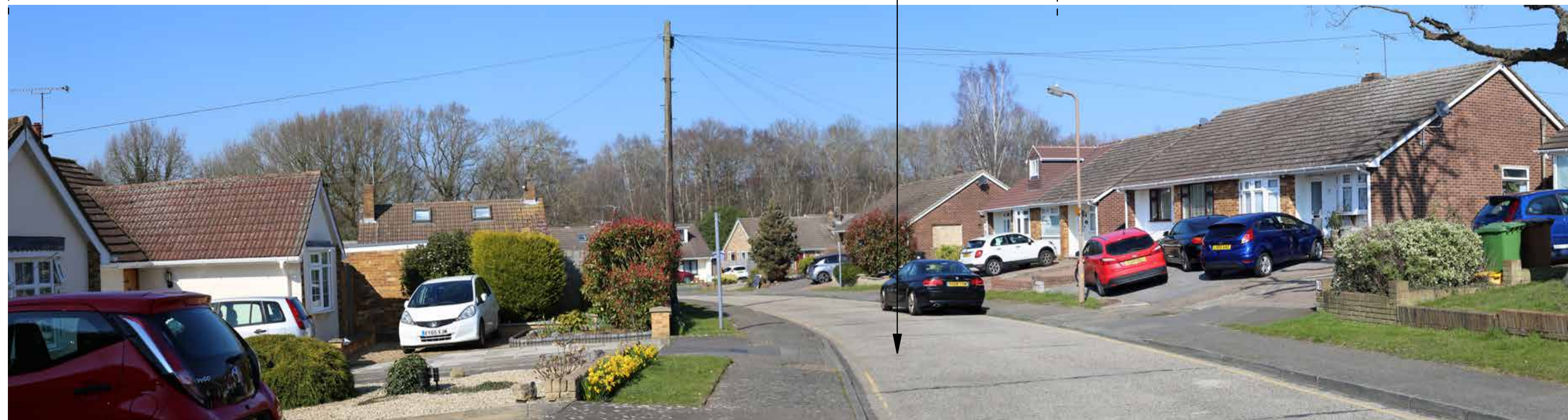
Site Context Photograph 11: View looking Southeast from Oakland Gardens

This panorama is not to scale. For contextual information only