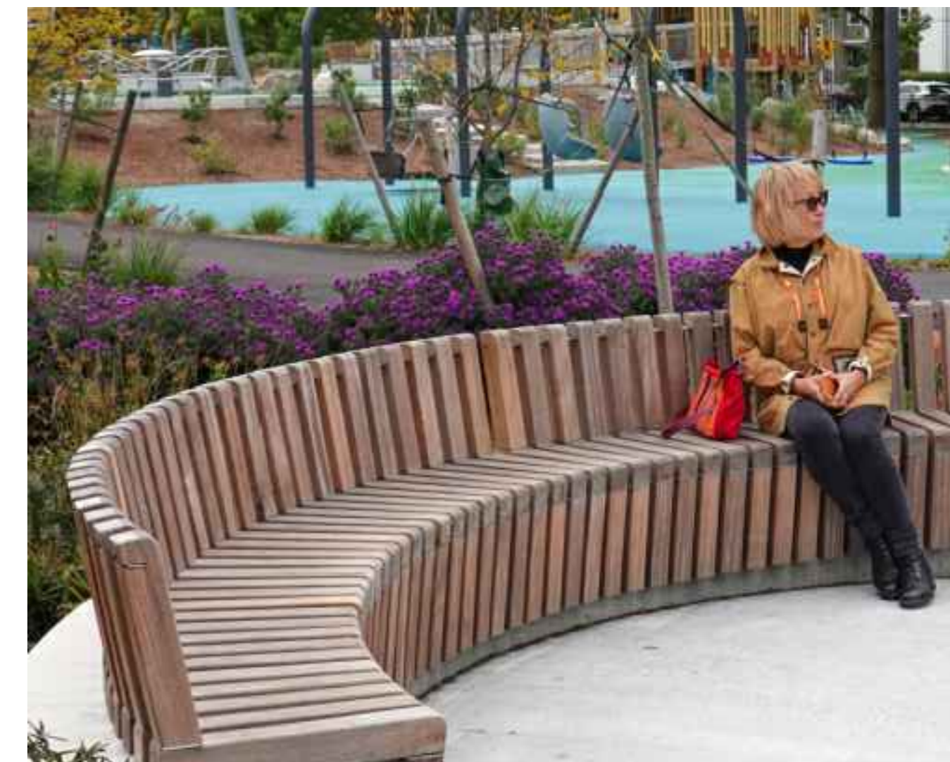
06 B3: Streetlites Solid Skirt Top Seat