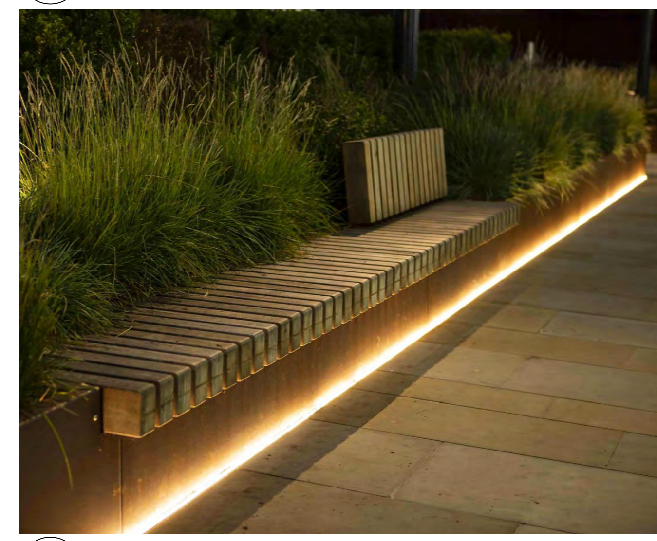
04 B2: Logics Integrated Timber Seating, Lighting Integrated