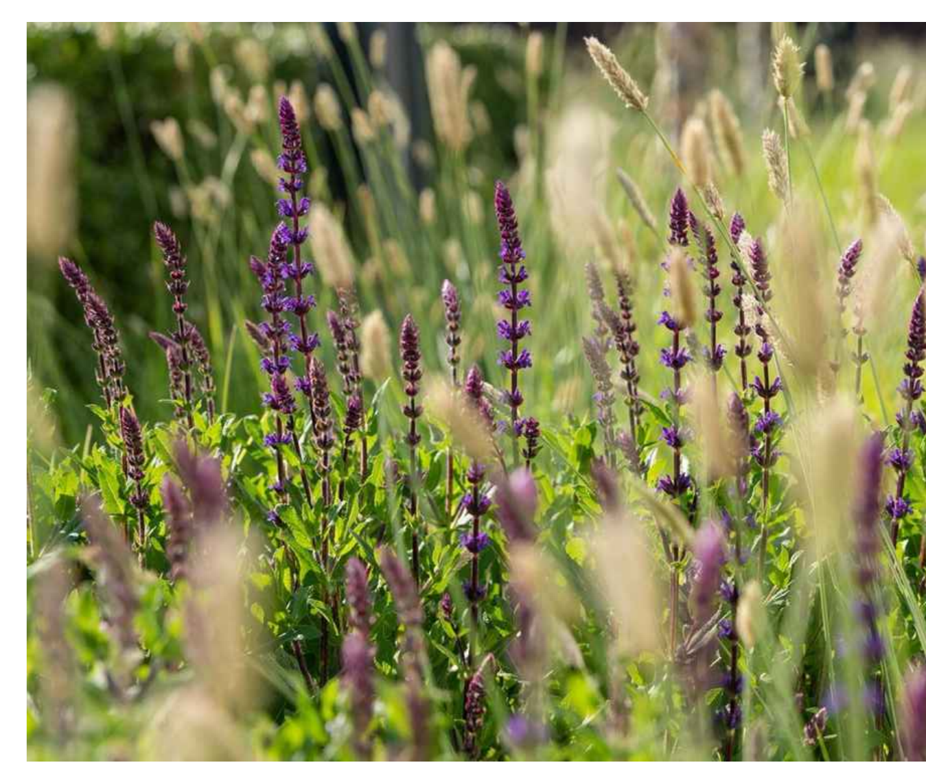
02 Ornamental Planting in Planter