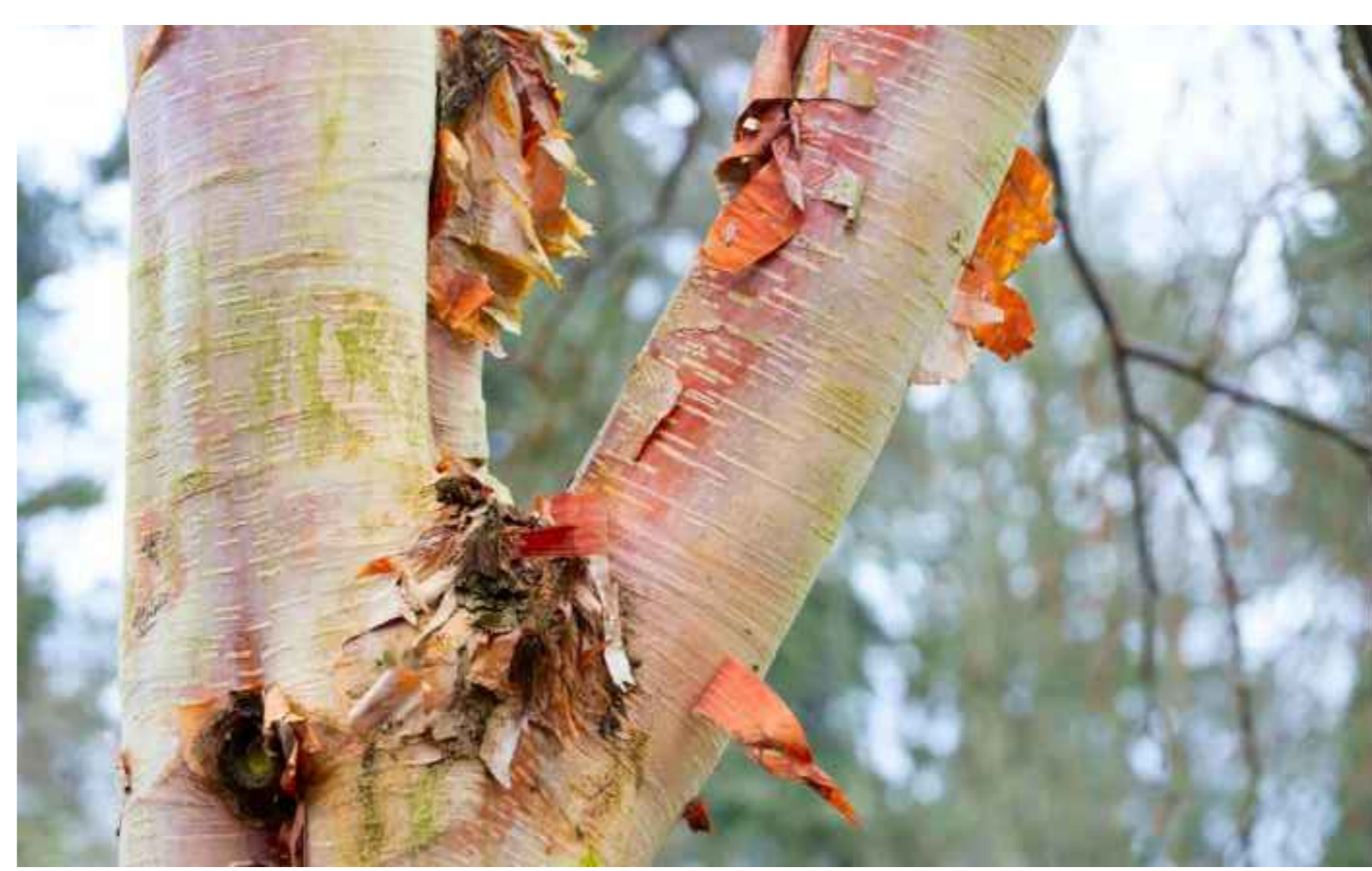
01 Multistem Betula albosinensis