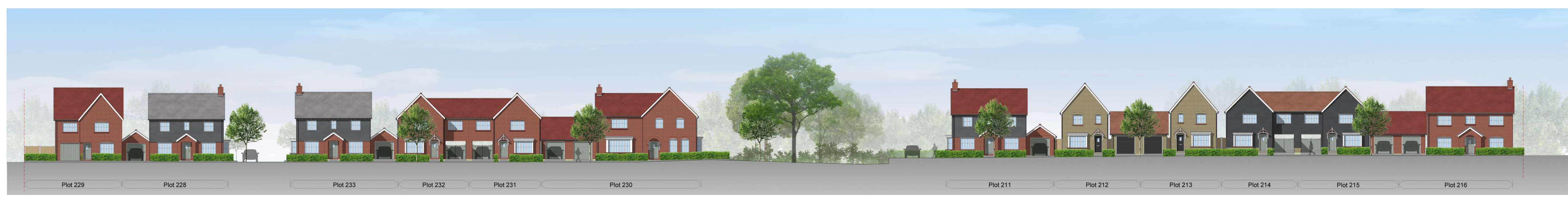
KEY ELEVATIONS STREET SCENE GG (NTS)