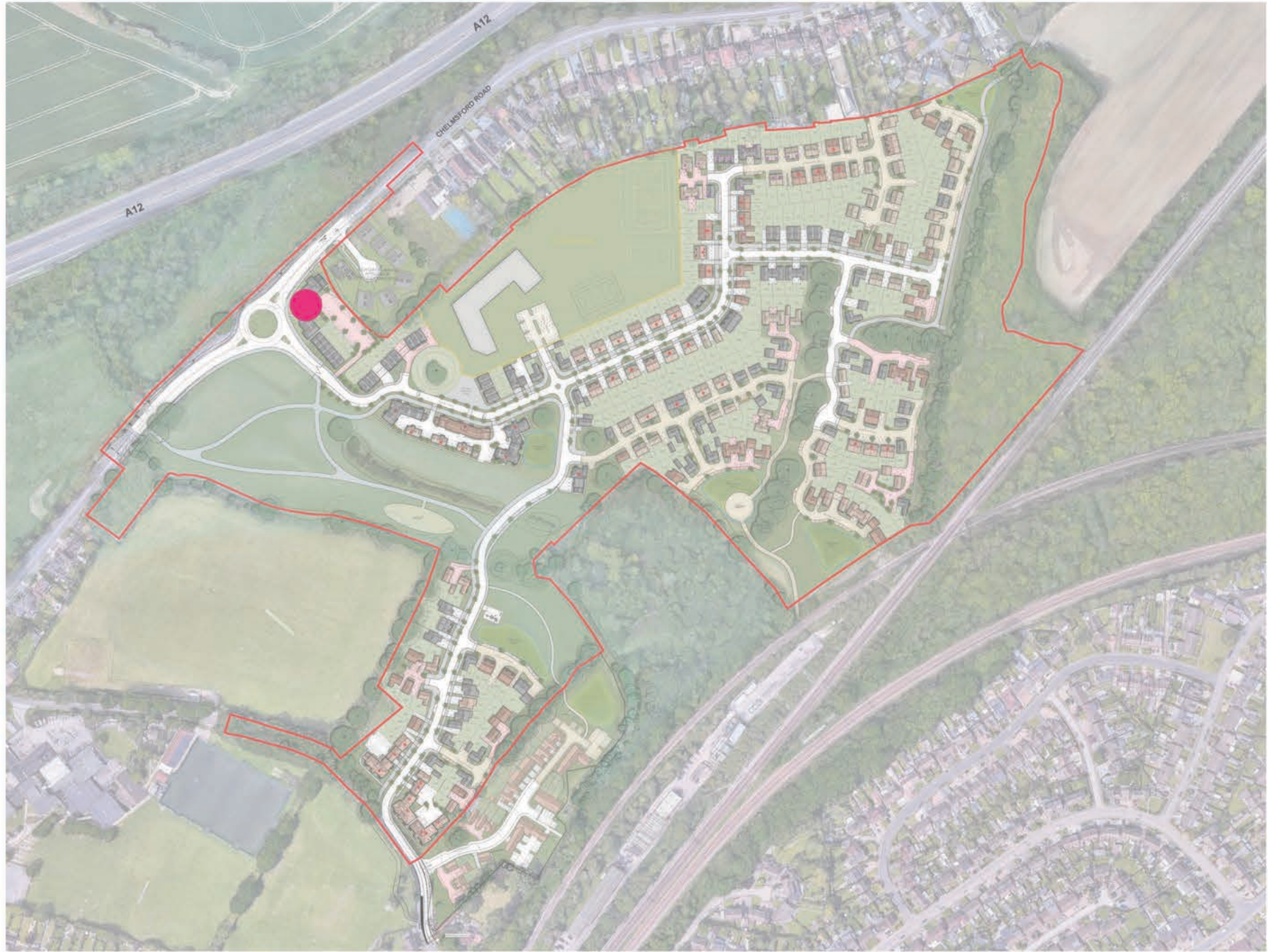
KEY PLAN NTS