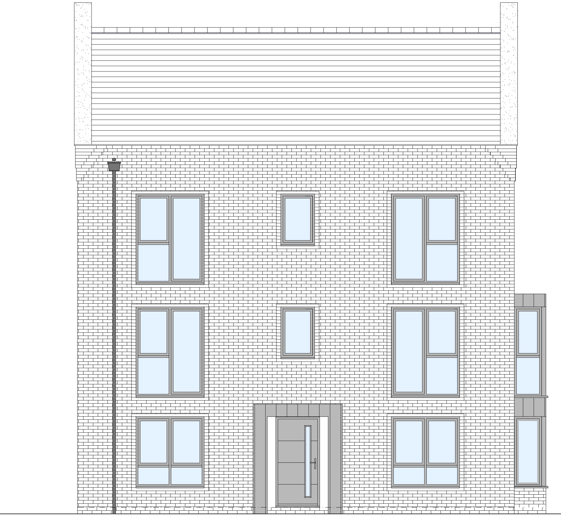
SIDE ELEVATION (MAIN ENTRANCE)