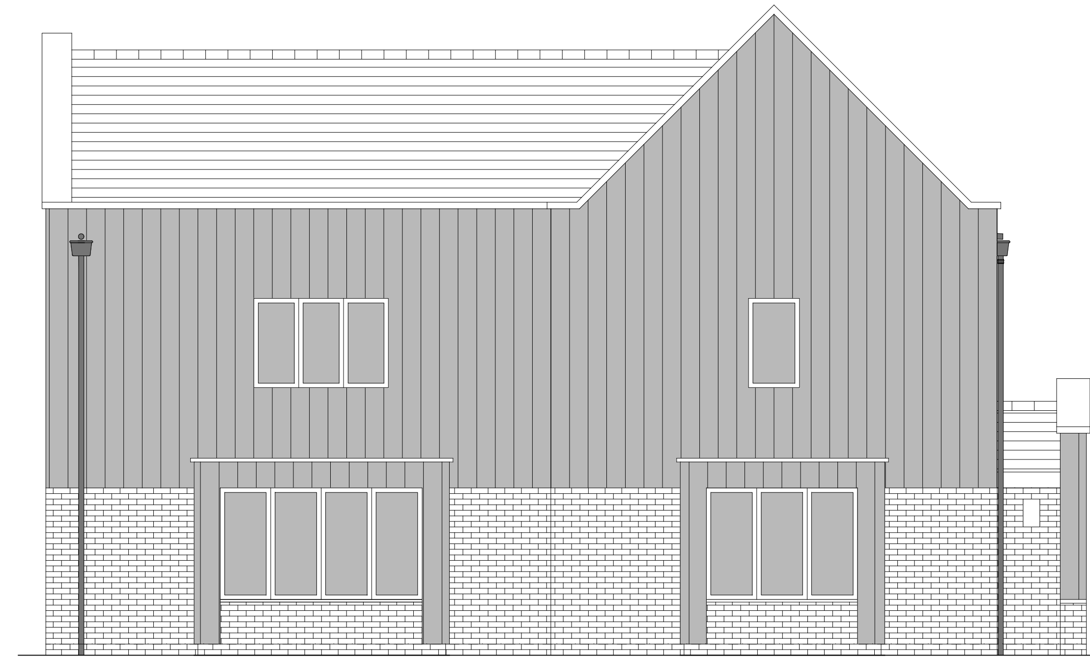
SIDE ELEVATION 1