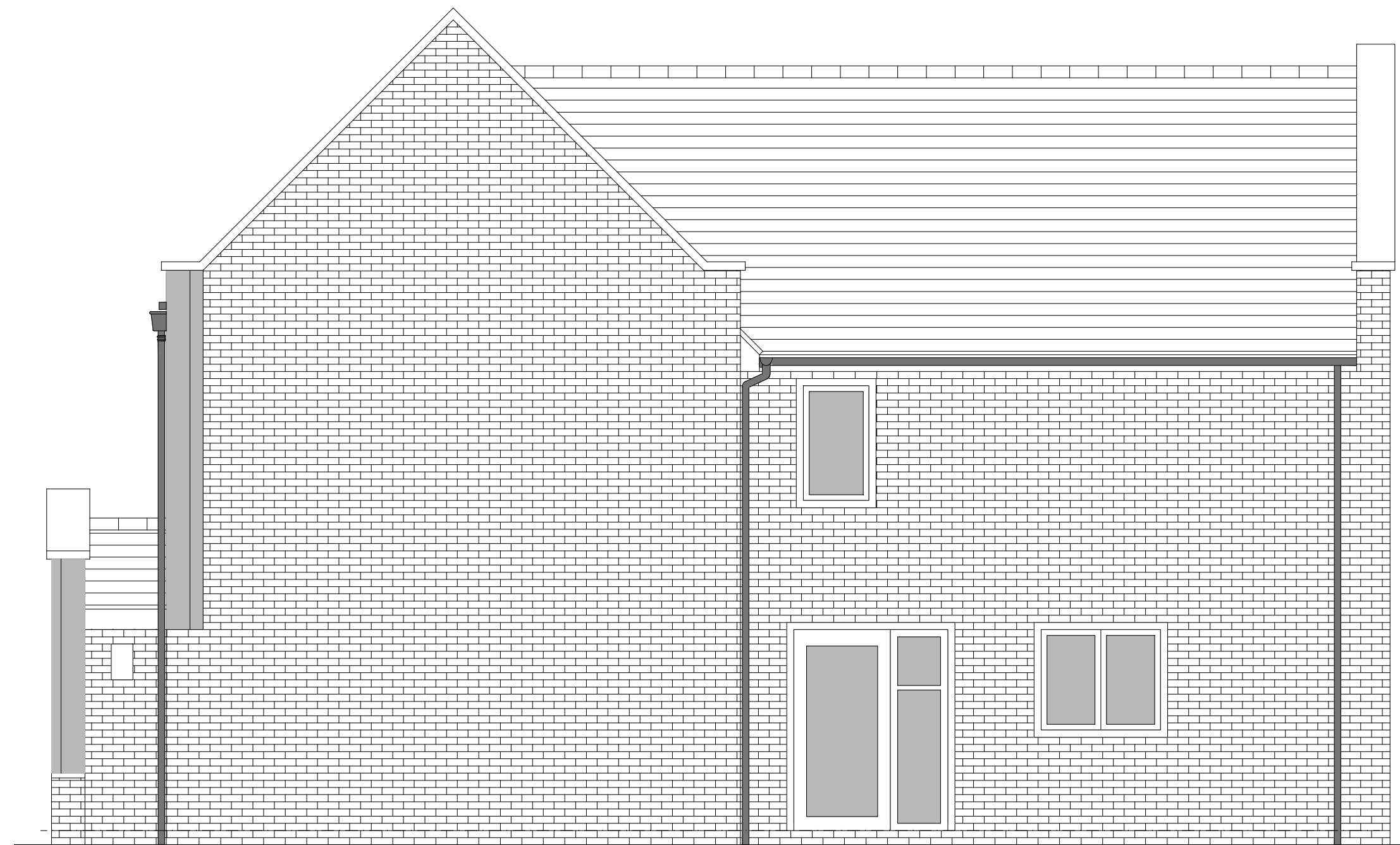
SIDE ELEVATION 2