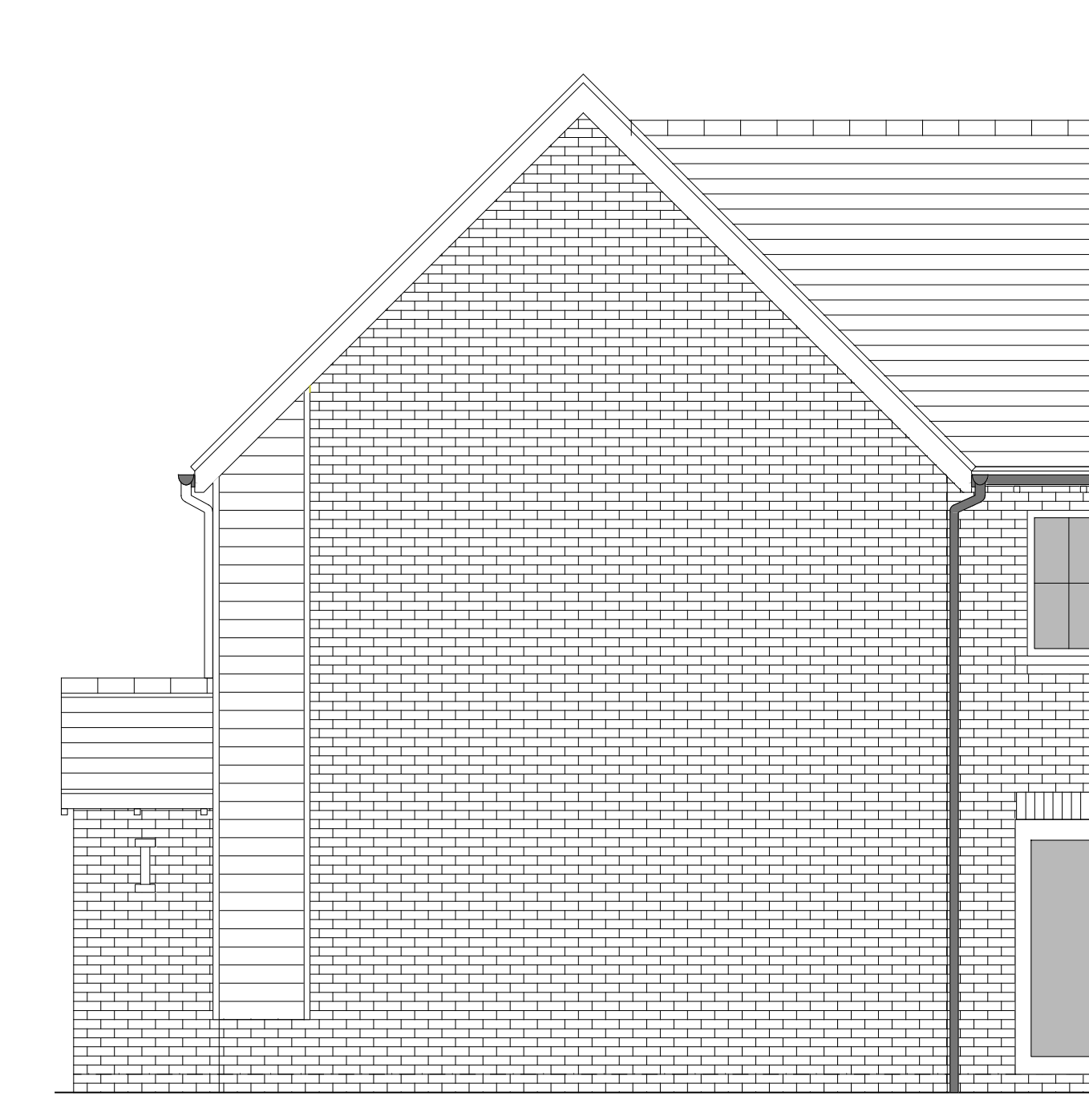
SIDE ELEVATION 2