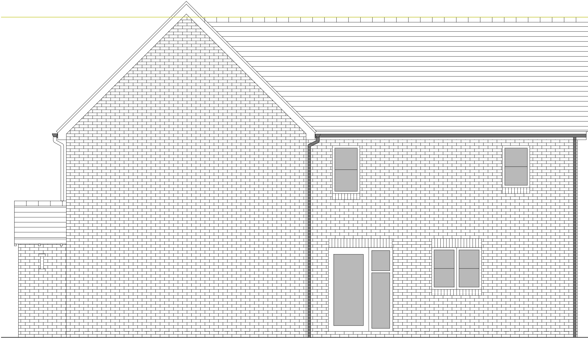
SIDE ELEVATION 2