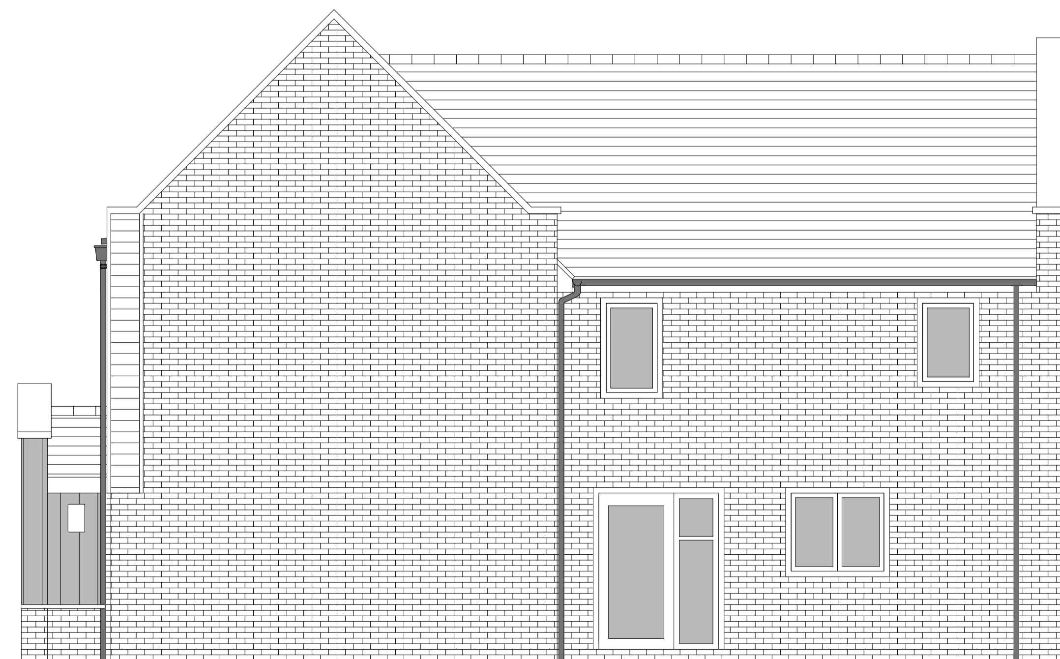
SIDE ELEVATION 2